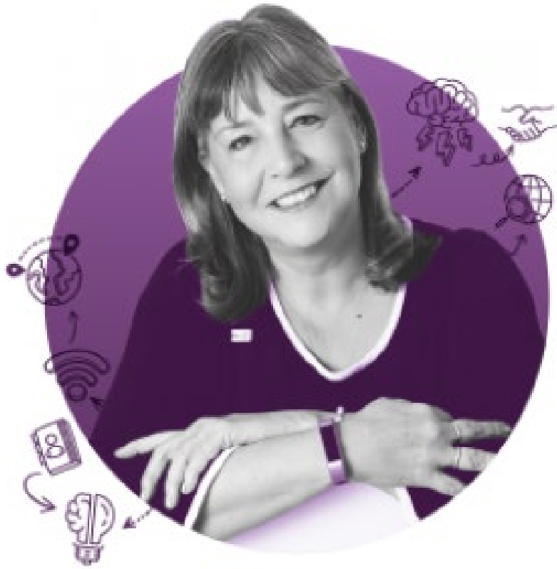
Increase Our Ability to Adapt