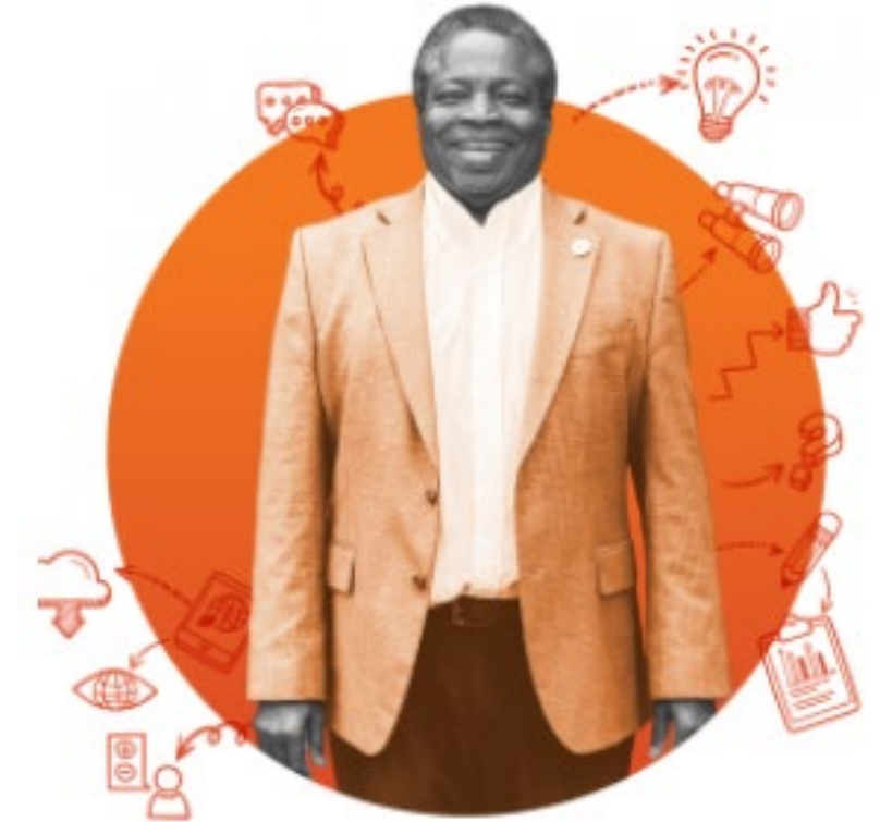
Enhance Participant Engagement