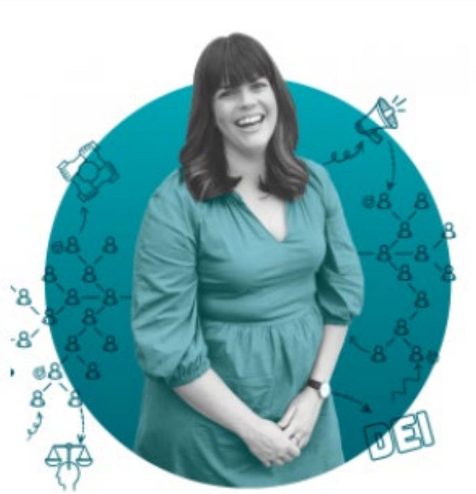
Expand Our Reach