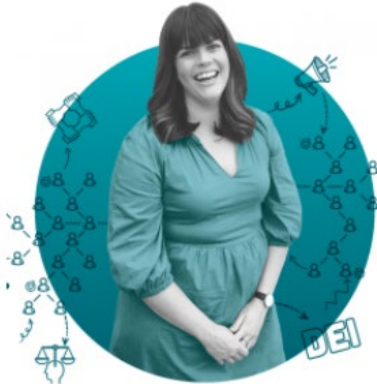
Expand Our Reach