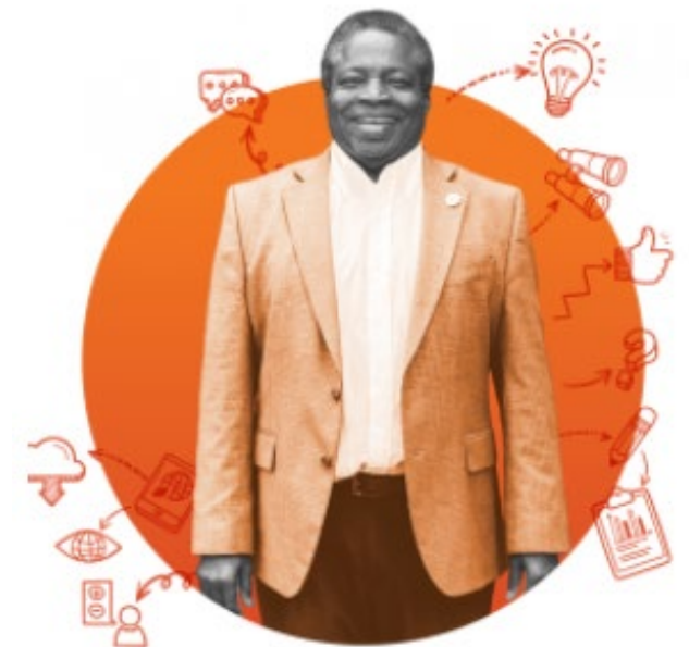
Enhance Participant Engagement